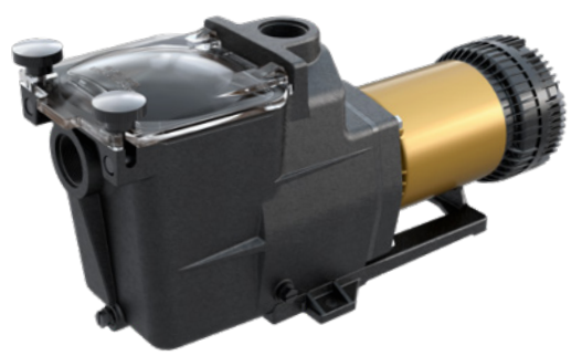
EXPERT LINE ONLY FROM POOL PROS