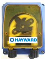
AC035 Feed Pump

The energy efficient system consists of a high gallon Hayward branded tank made of UV resistant plastics, and the AC035 low-power fixed output pump that works with 110V-220V 50/60Hz.